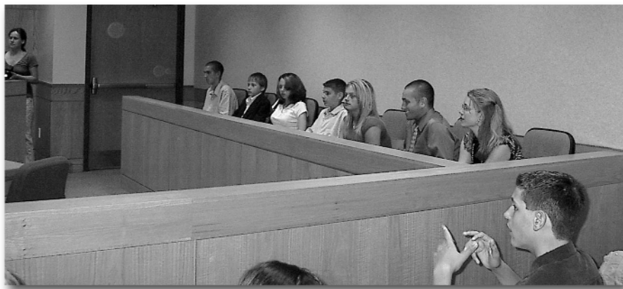
Jurors in the Colonie Youth Court Program (NY).