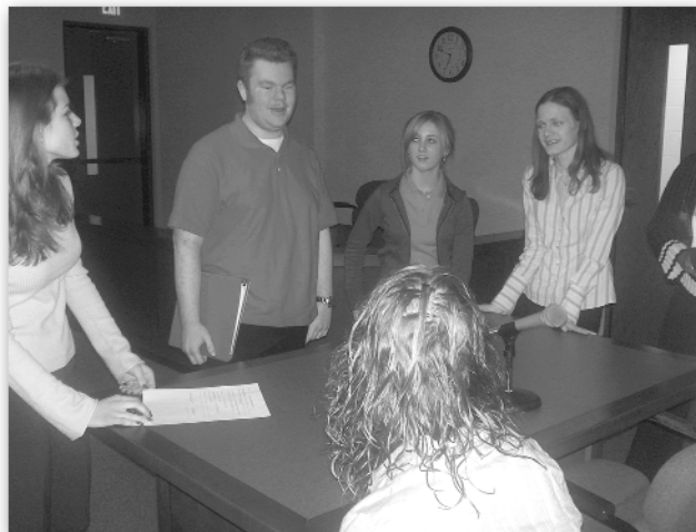
Teen jurors from the Jefferson County Teen Court (KY) deliberate.