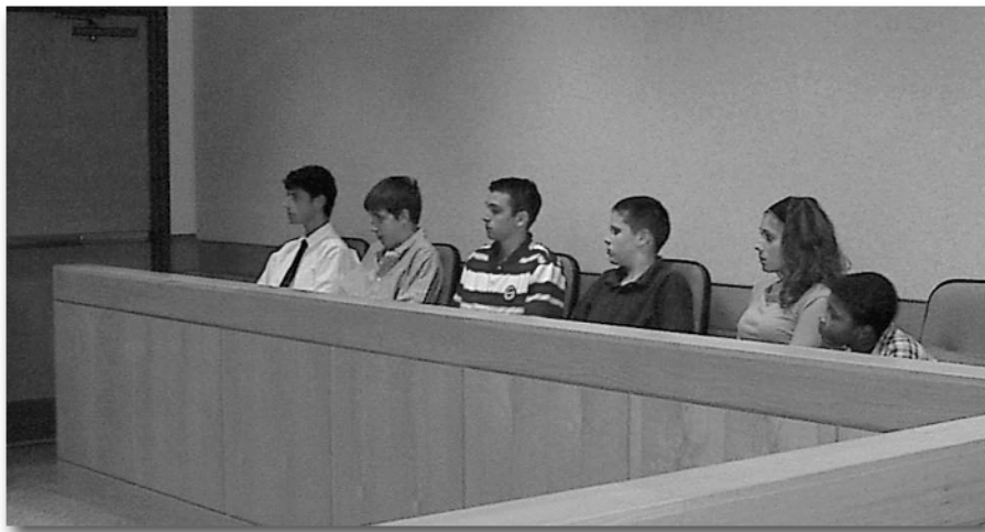
Colonie Youth Court Program (NY) jurors.