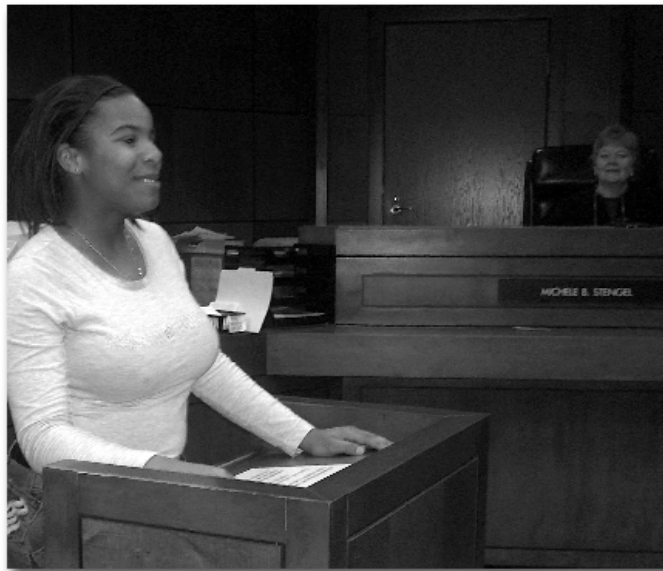
A teen attorney from Jefferson County Teen Court (KY) makes her opening statement.