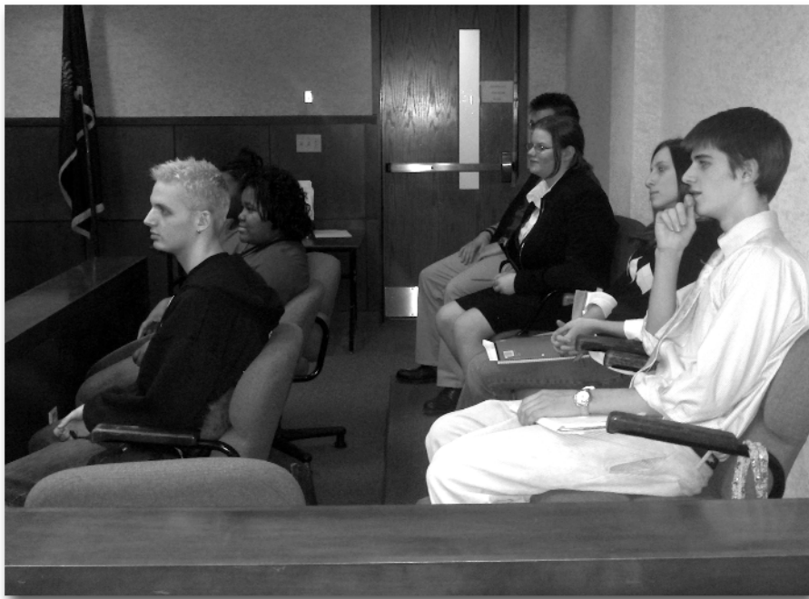
Jurors with the Jefferson County Teen Court Program (KY) listen to the facts of the case.

trauma unit; and interviewing a doctor about the types of injuries that result from reckless behavior. Youth may also be required to give speeches to younger students about the dangers of their behavior or to develop an education campaign about safe behavior.