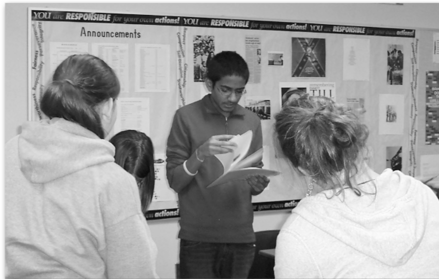
A juror studies a case at the Hazelwood Middle School Student Court in New Albany (IN)

Additional dispositions may be available to youth courts under state statutes. For example, some youth courts may be able to impose loss of driving privileges or delay in eligibility for driving privileges. These dispositions are generally ordered in cases involving drugs, alcohol, tobacco, and traffic violations.