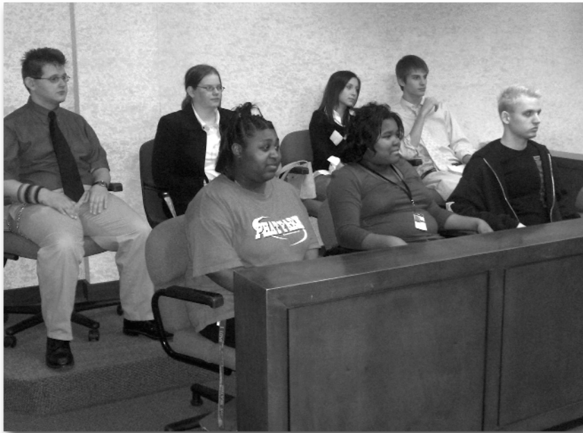
Jurors from the Jefferson County Teen Court (KY).