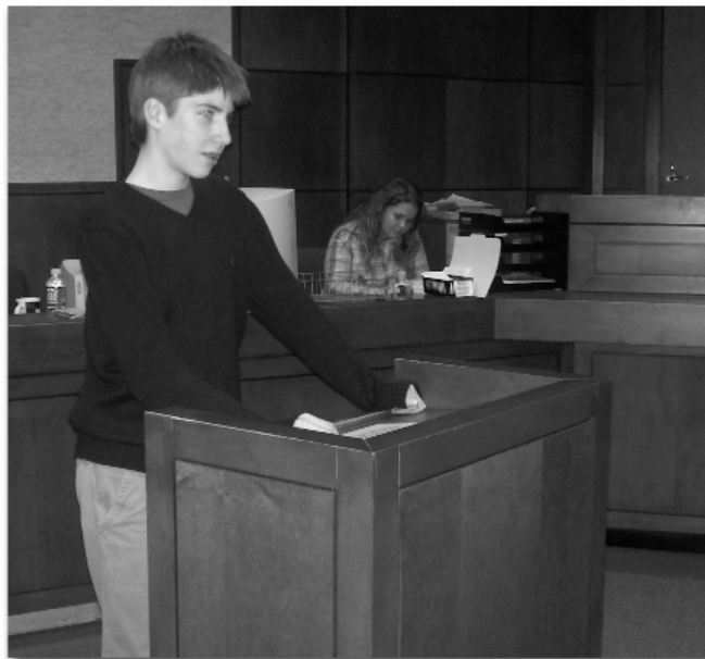
A teen attorney from the Jefferson County Teen Court Program (KY) makes closing arguments.