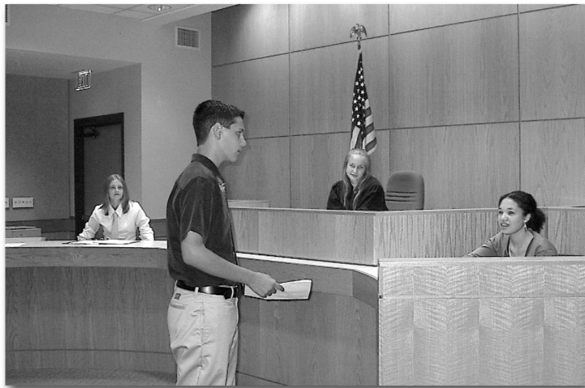
Teen attorney from the Colonie Youth Court Program (NY) questions a witness.

problems with truancy, remedial work or peer tutoring, and having the respondent tutor elementary school students. Youth courts may also order respondents to call a mentor when they wake up in the morning or to meet a mentor in school before class. Youth courts may also order youth and parents to take classes on education laws in the state.