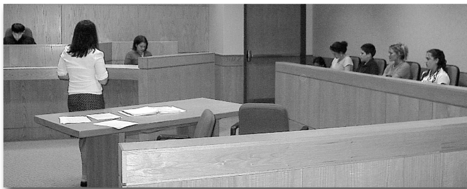
Proceedings in the Colonie Youth Court Program (NY).