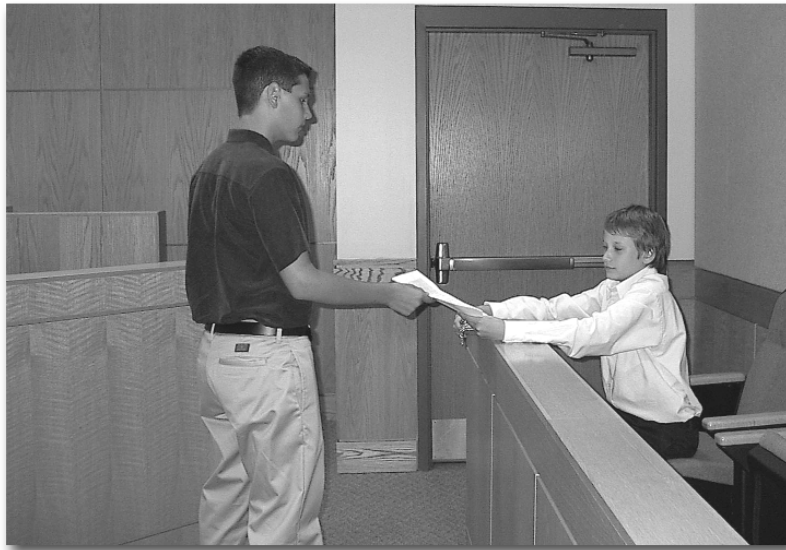
Participants in the Colonie Youth Court Program (NY).